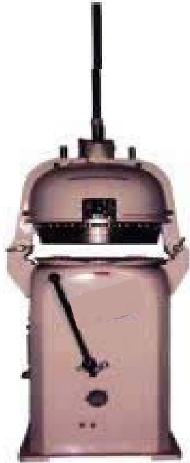
Model BRD-36-3 shown