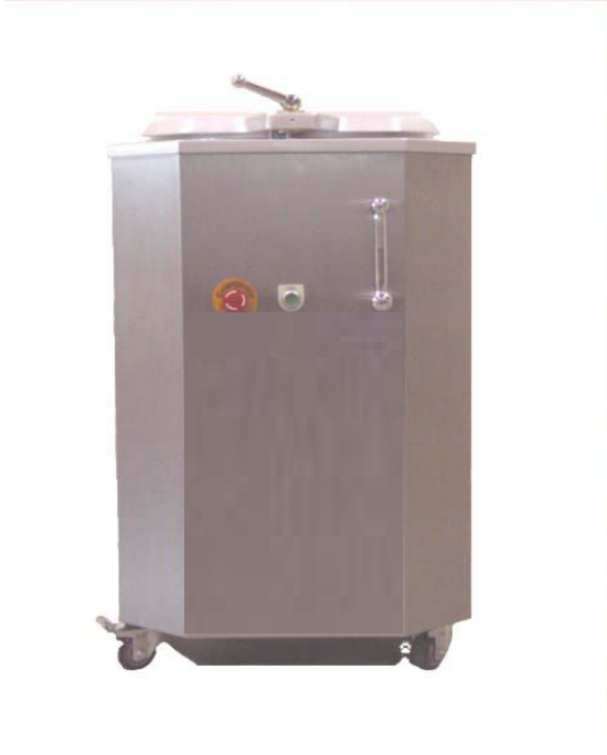
Model HDD-20 shown