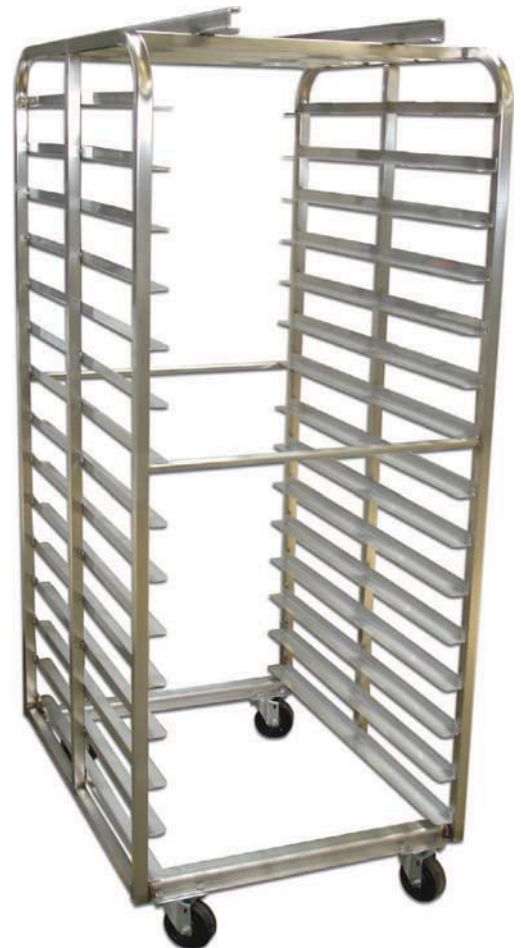
Stainless Steel Double Oven Racks