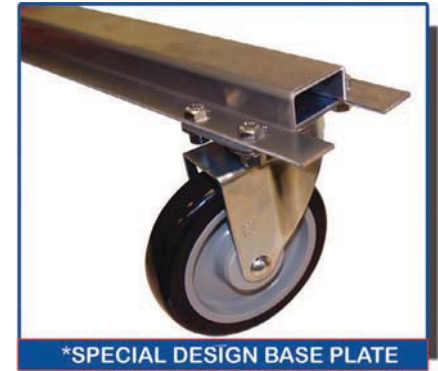
*SPECIAL DESIGN BASE PLATE