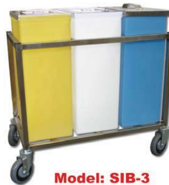
Model: SIB-3 Shown Here