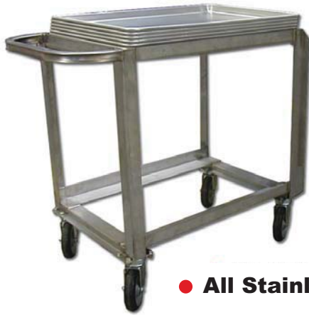
Model: SSPC-1826 Shown Here