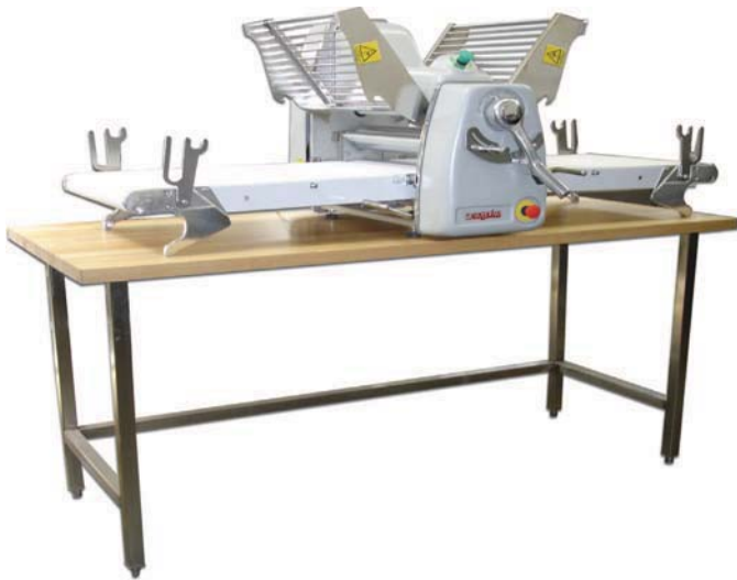
Table top sheeter