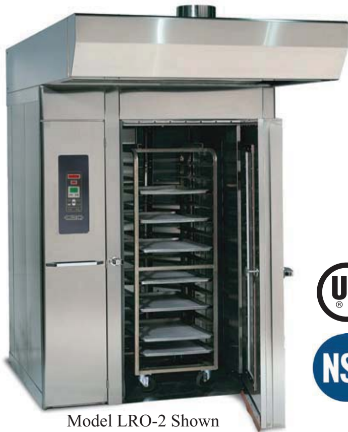
Model LRO-2 Shown (Rack not included)