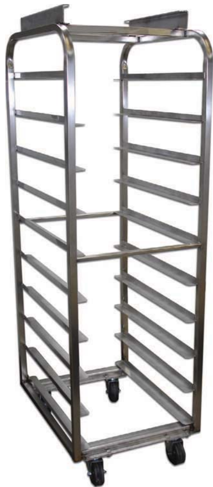
Stainless Steel Single Oven Racks

Special base plate design will out last any other rack on the market