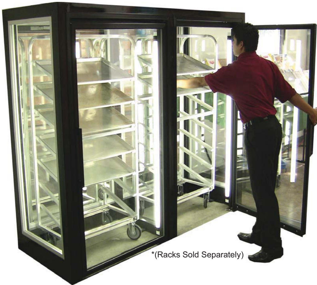
*(Racks Sold Separately)